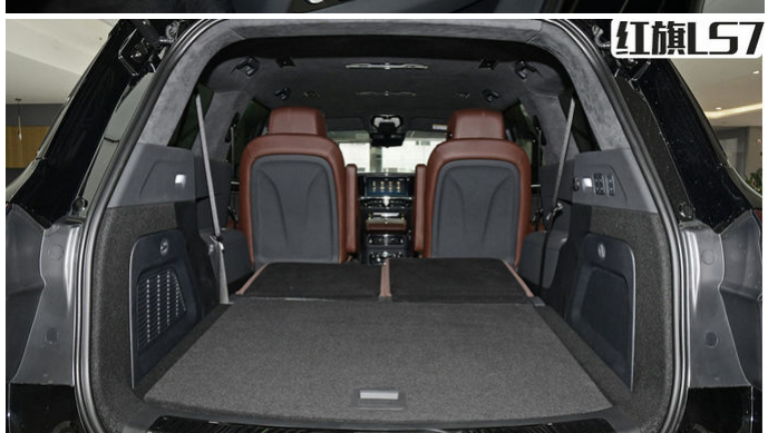
两台车的后备厢都非常规整,第三排座椅放倒以后也是 完全的平面。同时第三排也都支持电动放倒功能和尾门玻璃 独立开启功能,领航员还多了感应后备厢的功能。